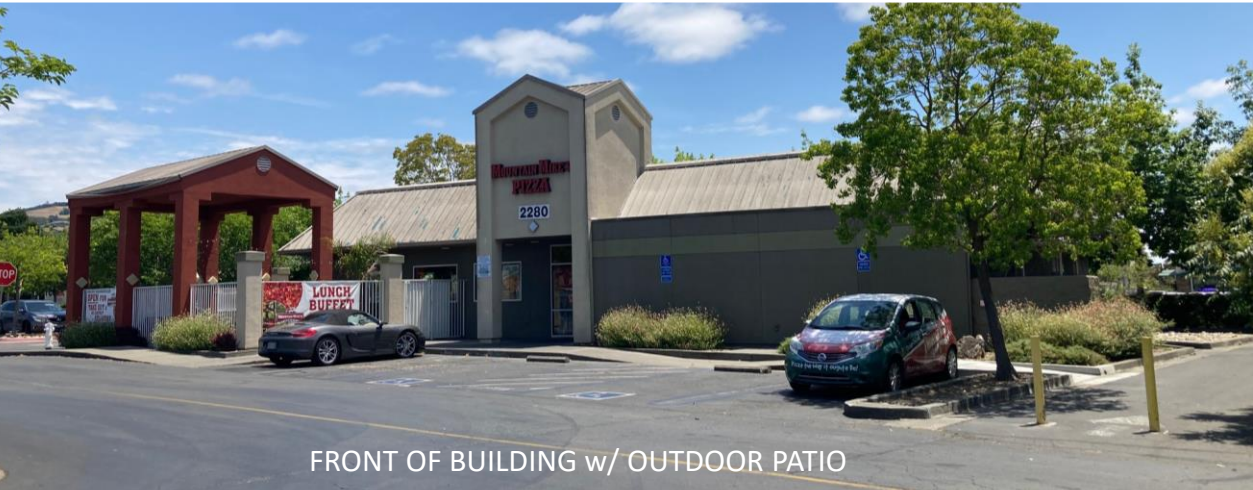
FRONT OF BUILDING w/ OUTDOOR PATIO

JOHN SCHAEFER (415) 235-8115 john@keystonerea.com CA LIC: 0125740