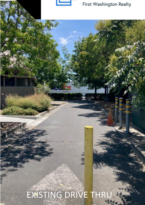
EXISTING DRIVE THRU