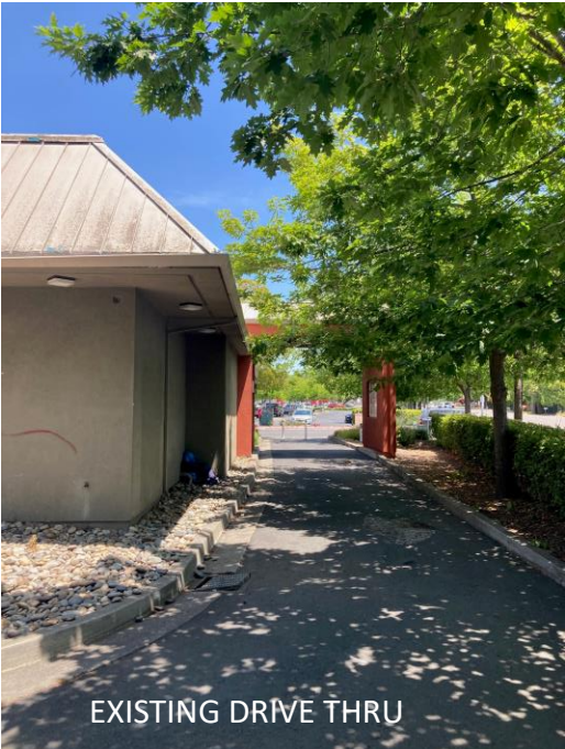
EXISTING DRIVE THRU